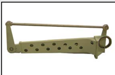
OPTIONAL PARALLEL LINK TOOL