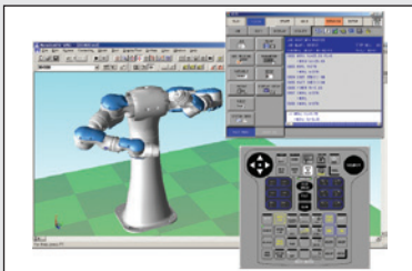
MOTOSIM EG-VRC (OPTION)