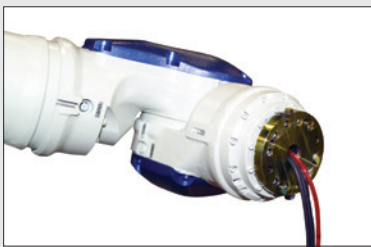
THRU-ARM CABLE AND HOSE ROUTING